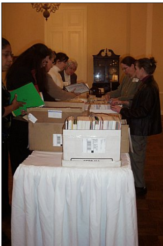
Hurricane-affected teachers select from donated music (left) and these LMTA members (below) received checks from the many donations made by music teachers like you. Thank you, OMTA!