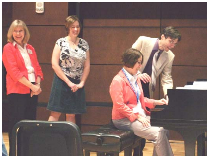
Teachers participate in sessions at the State Conference in May, Oklahoma City University, OKC.