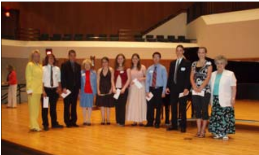
OMTA Senior Audition first place Winners gave a fine recital at the OMTA State Conference. See all the Senior Audition Winners and their teachers listed on page 7 of this issue.

One of the decisions made at the recent conference may affect you if you have a provisional membership. The board voted to align the applied music requirement for