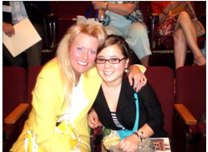
Membership enjoyed fine performances by students and excellent presentations by our clinicians at the State Conference in Norman.

OMTA presented its first two CFO Fellow Awards during the conference to