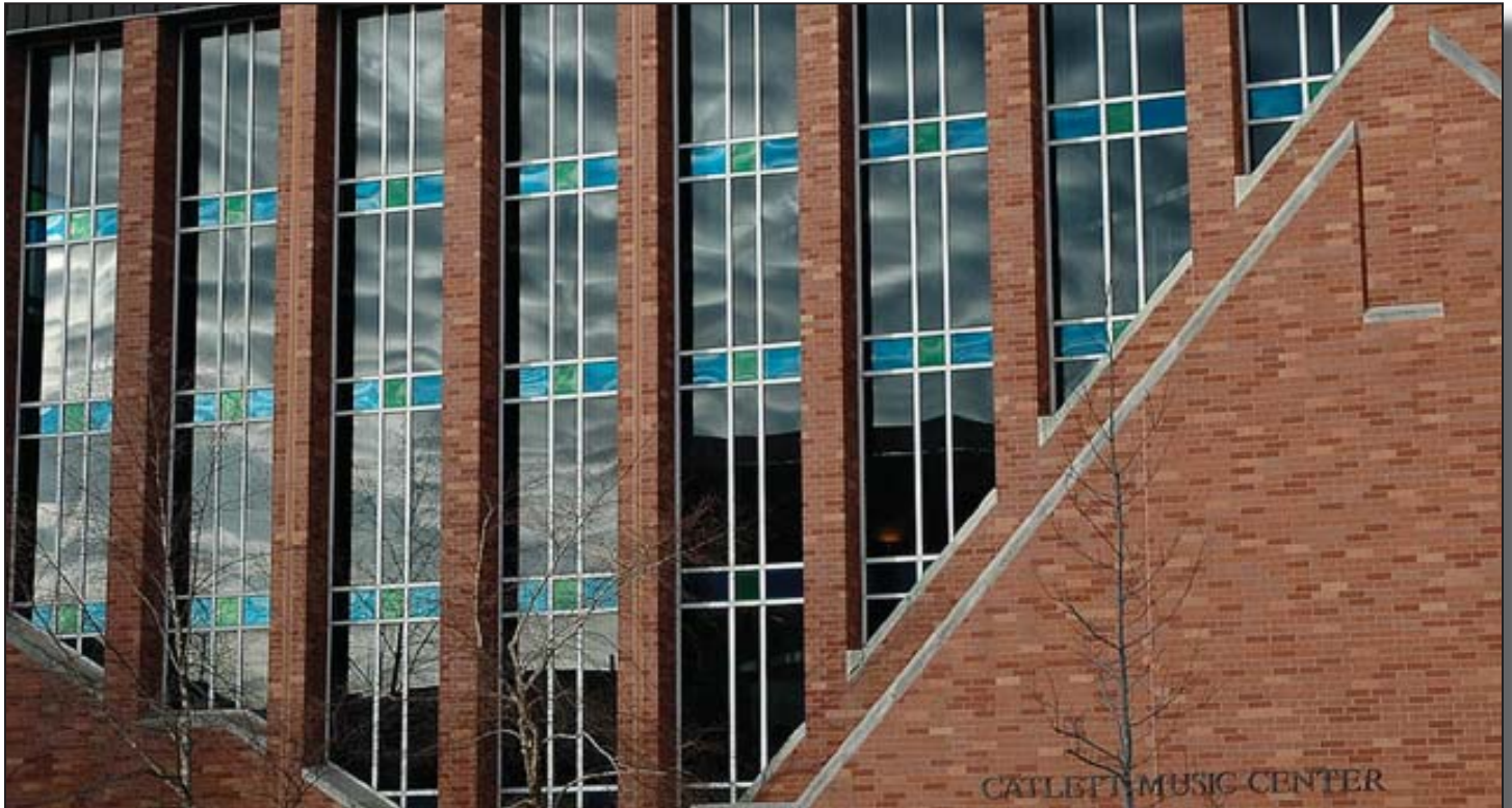
THE CATLETT MUSIC CENTER AT THE UNIVERSITY OF OKLAHOMA SITE OF THE 2013 OMTA CONFERENCE