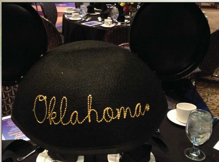
The table is set for the OMTA contingent at the MTNA National Conference held in March at the Disneyland Hotel in Anaheim, California.