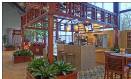
STARBUCKS AT THE HILTON TULSA SOUTHERN HILLS HOTEL