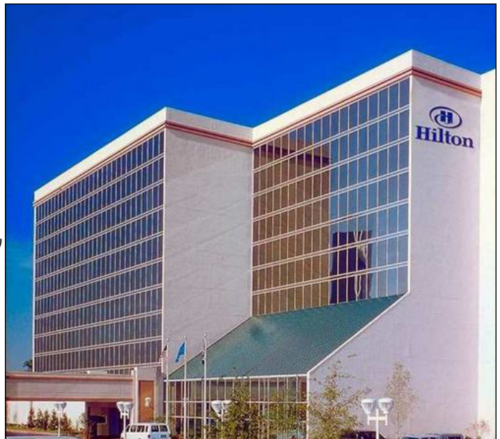
THE HILTON TULSA SOUTHERN HILLS HOTEL